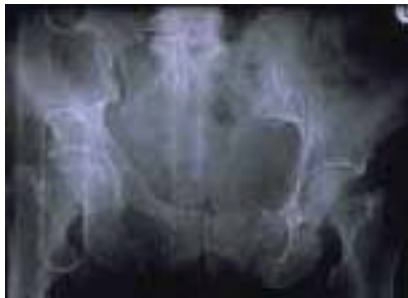
A-P view with right sacroiliac disruption and rami fractures from lateral compression