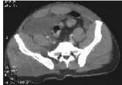
CT demonstrating right sacroiliac fracture and extensive extraperitoneal hematoma