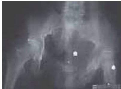
A-P view with both rotational and vertical instability